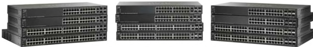
Figure 1. Cisco 500 Series Stackable Managed Switches

Cisco 500 Series switches are designed to protect your technology investment as your business grows. Unlike switches that claim to be stackable but have elements which are administered and troubleshot separately, the Cisco 500 Series provides true stacking capability, allowing you to configure, manage, and troubleshot multiple physical switches as a single device and more easily expand your network. The Cisco 500 Series switch offer models which are fanless making it one of the industry's first in stackable switches, thereby delivering increased reliability, power efficiency, and minimizing noise.