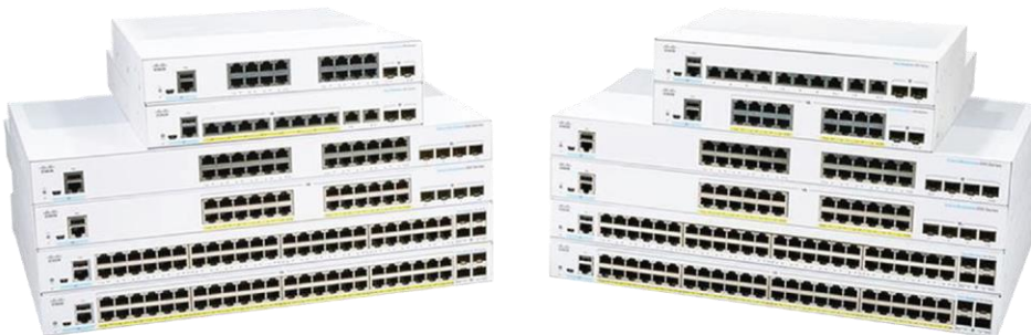
Figure 2. Cisco Business 250 series smart switches

The Cisco Business 250 Series is the next generation of affordable smart switches that combine powerful performance and reliability with a complete suite of the features you need for a solid business network. These switches provide flexible management options, comprehensive security capabilities and Layer 3 static routing features far beyond those of an unmanaged or consumer-grade switch, at a lower cost than for fully managed switches. When you need a reliable solution to share online resources and connect computers, phones, and wireless access points, Cisco Business 250 Series Smart Switches provide the ideal solution at an affordable pricing point.