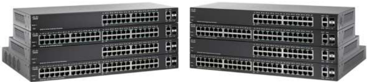
Figure 1. Cisco 220 Series Smart Switches

For businesses requiring high performance, security, and manageability from network switches, fully managed switches are an excellent choice. However, they typically come with high price tags. Smart switches provide the right level of network features and capabilities for growing businesses at lower prices, so you have more dollars to invest where they're most needed.