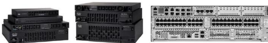
Figure 1. Cisco 4000 Series Integrated Services Routers

The Cisco 4000 Family contains the following platforms: the 4461, 4451, 4431, 4351, 4331, 4321 and 4221 ISRs.