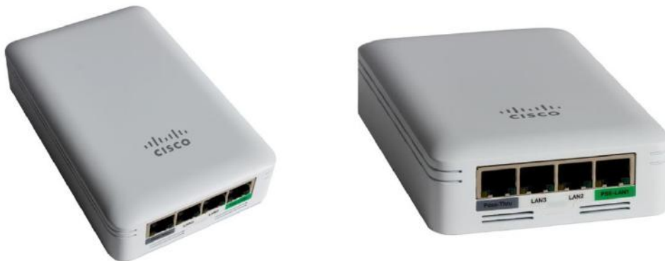
Figure 1. Cisco Aironet 1815w Access Point

Packing 802.11ac Wave 2 wireless standards support and Gigabit Ethernet wired connectivity into a sleek device, the 1815w is built to take full advantage of existing cabling infrastructure while blending into the visual footprint. This combination provides best-in-class performance while reducing total cost of ownership.