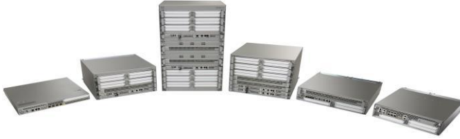
Figure 2. New Cisco ASR 1001-X Aggregation Services Router