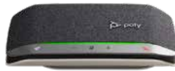
POLY SYNC 20