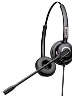
Fanvil - HT202