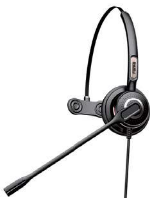
Fanvil - HT201

Fanvil HT201 & HT202 offer a range of premium quality headsets using Fanvil's innovative acoustic technology to deliver speech clarity and an excellent audio experience. Coupled with our sleek design that focuses on comfort and durability, the Fanvil HT201 & HT202 headset offers a new level of experience for call center professionals.