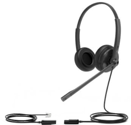
YHS34/YHS34 Lite Dual