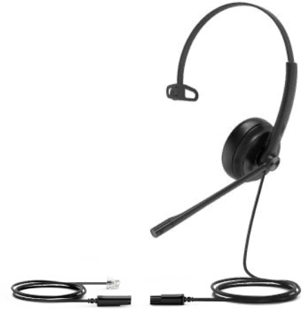
YHS34/YHS34 Lite Mono

Built for comfort with soft ear cushions and ultra-lightweight materials, the YHS34/YHS34 Lite is 10%~30% lighter than other headsets in the same range. Its ergonomic design makes this headset comfortable enough for long conference calls and all day use.